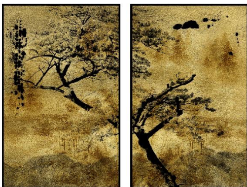
Figure 1 Gavin Mitchell, Shadow Moon , Archive Print on Hand Finished Gold Leaf board, 2026.

Mitchell's practice is grounded in the belief that found material and visual history contain infinite narratives, and his studio work often evolves from deep engagement with photographic archives, vintage elements and layered composition strategies. This approach gives his art a distinctive voice that echoes tradition while embracing contemporary visual culture.