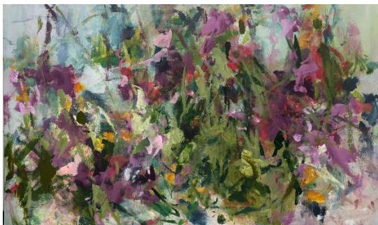
Andrea Varotto, Series Freedom 004 , Acrylic on Canvas, 2026.

Andrea Varotto's current body of work centres on the dialogue between nature and the inner emotional world. Her paintings are abstract yet evocative, built through layered gestures, luminous colour and rhythmic structures suggesting landscapes, natural energy or organic movement. Rather than depicting nature directly, she translates sensations it provokes: light, atmosphere, stillness and motion, into painterly form.