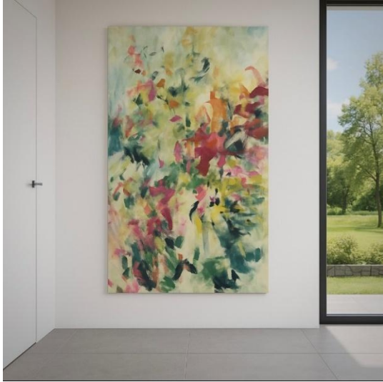
Andrea Varotto, Series Freedom 001 , Acrylic on Canvas, 2026.

Varotto's work is sold primarily through the primary gallery market and international art fairs. Large-scale works from major series typically range between £4,000 and £9,500 depending on size and series. Her market presence is growing through international fairs and exhibitions across Europe and South America.