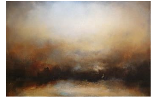
As Twilight Sang of Hope Renewed | Kerr Ashmore

Kerr Ashmore is a British contemporary landscape and abstract artist. Inspired by land, sea and sky, her works are reflections of nature, memory, and emotion. Kerr's work is beautifully aesthetic, often large in scale, and always emotionally powerful. Kerr grew up in North Yorkshire. Her atmospheric landscapes are the result of the reflections of nature, memory and emotion inspired by the surrounding beauty of the dramatic and ever-changing movement of light and dark that can so drastically change the natural landscape.